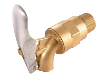
Self Closing, 3/4" BSPP