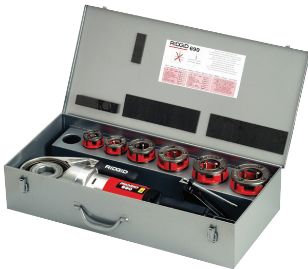
Model 690-I Power Drive