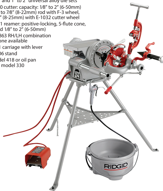
Model 300 Complete