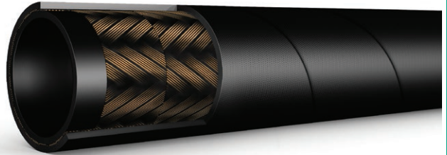
EN853 - 2 - DIN20022 - 51 mm - SAE