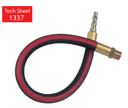
3/8" Bore Rubber-Tech Hose, Plug One End x Male Thread, BSPT