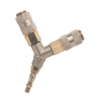
2 x Coupling Outlets, 1 x Plug Inlet