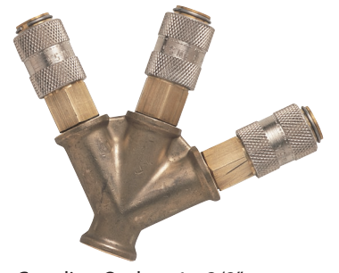
3 x Coupling Outlets, 1 x 3/8" BSPP Inlet