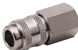
Female Thread, BSPP