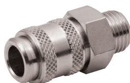
Male Thread, BSPP

Interchangeability: Camozzi Mini, Cejn 50, Legris 21, Norgren 233, Rectus 21 and Schrader Mini