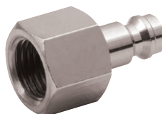
Female Thread, BSPP