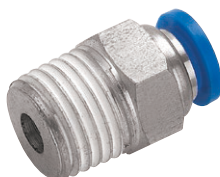
Male Thread (Hex Body), NPT