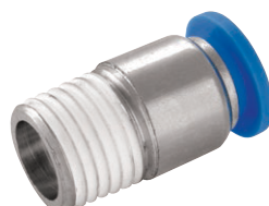
Male Thread (Round), NPT