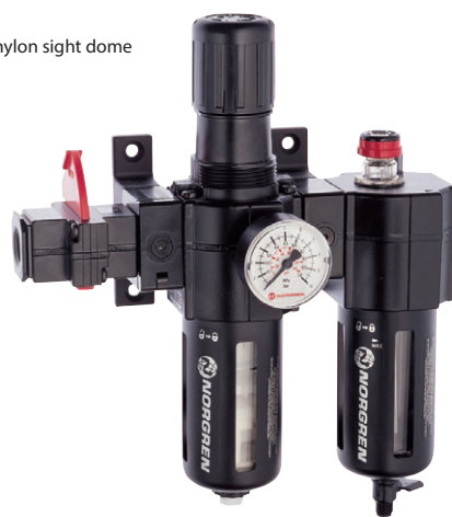
Guarded Transparent, BSPP

Filter/Regulator: Acetal bonnet. Sintered polypropylene element. Brass valve Lubricator: Transparent nylon sight dome