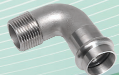
Compact, Female x Male Thread, BSPT