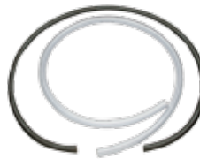
Discharge Hose - Reinforced PVC, 5 ft. length, 3/4" ID x 1" OD, P/N 107435