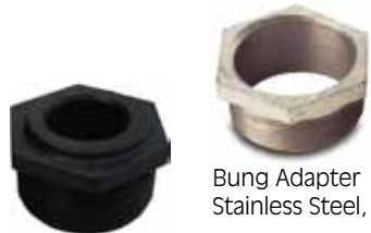
Bung Adapter Stainless Steel, P/N 107426