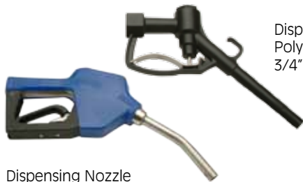
Dispensing Nozzle Stainless steel /FKM nozzle with 3/4" hose barb - P/N 107231