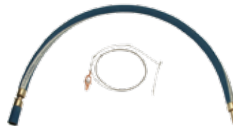
Static Protection Kit - includes 4 ft. synthetic rubber cross-linked poly- ethylene grounded hose with brass fittings with 3/4" MNPT, ground wire, and clamps - P/N 107429