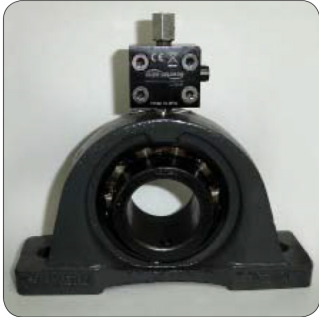
Lube Point Monitor shown with bearing. (Bearing not included)

* CAUTION! Destruction or damage of reed contact! Take notice of the max. contact loads! The max. contact loads (switching voltage, switching current and switching capacity) refer to pure ohmic loads and may not be exceeded under any circumstances. High voltage and current peaks can occur, particularly when switching inductive or capacitive loads (e.g. relay coil, capacitors). Even if the overload is brief, this can destroy (welding the contacts) or damage (reduced lifespan) the reed contact. - Only use protection methods which are appropriate and checked. Protection method when electrical connection of reed contacts: The following protective circuits are basically possible: current limiting resistors, RC circuits, freewheeling diodes, suppression diodes, varistors or a combination of these.