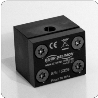
Lube Point Monitor (Part #55105)